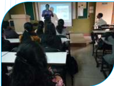
Session on Pre-Budget