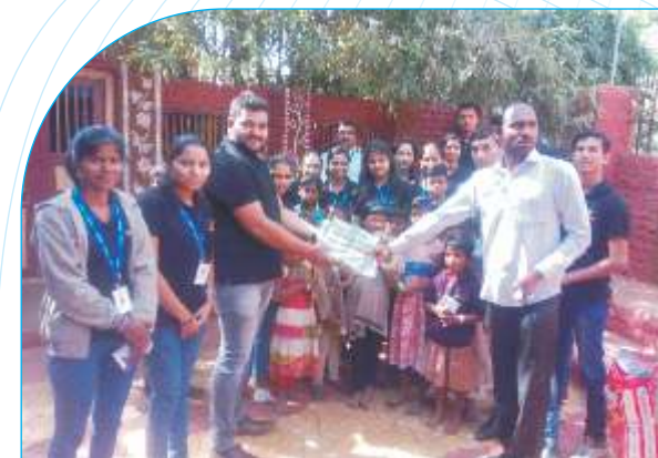
Visit to Orphanage