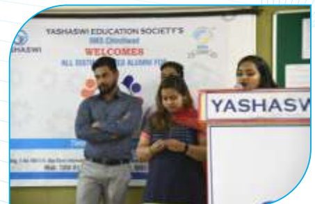
Alumni Sharing the nostalgic experience of IIMS Student Life