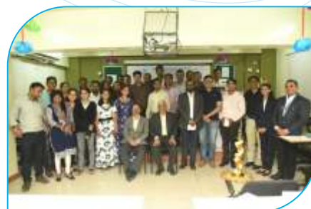
Group Photo session at the Culmination of Yashomilap-2019