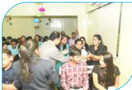
Director IIMS Felicitating Prestigious Alumni