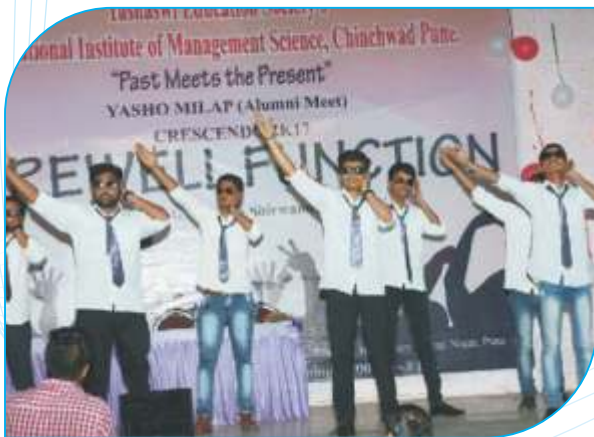
Performance of IIMS Student at Crescendo