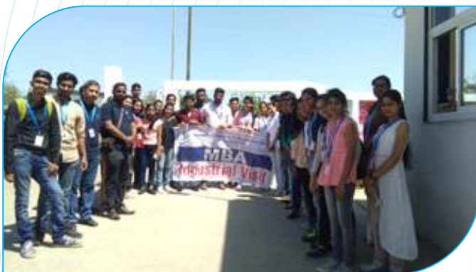
MALA Food Products P Ltd