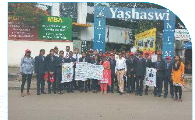
Road Safety Awareness