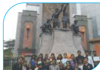
Visit to Freedom Fighter's Home