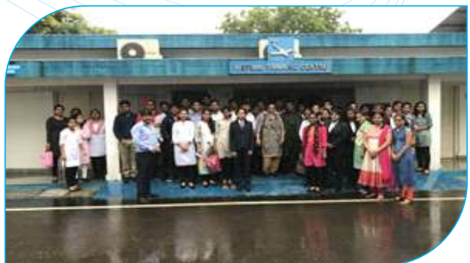
Virtual Training Centre at NDA