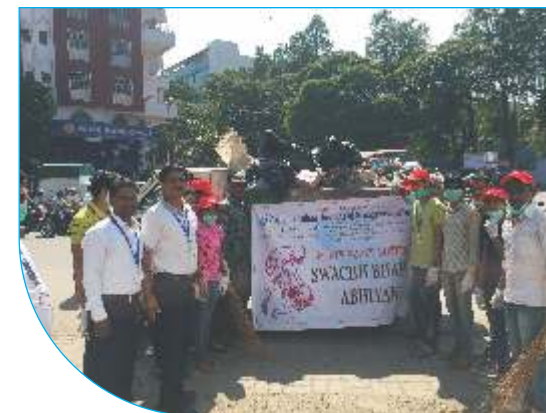
Swachh Bharat Abhiyan