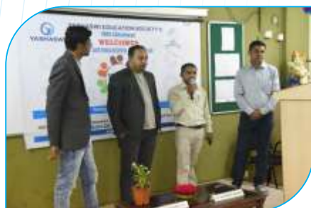
Alumni Sharing the nostalgic experience of IIMS Student Life