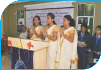
Beginning of Academic Session by Praying to Goddess Saraswati