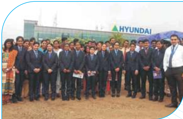
Hyundai Equipments P Ltd