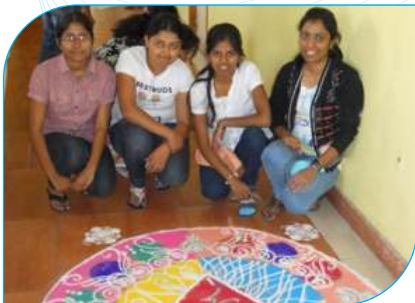
IIMS Students Posing with their Rangoli