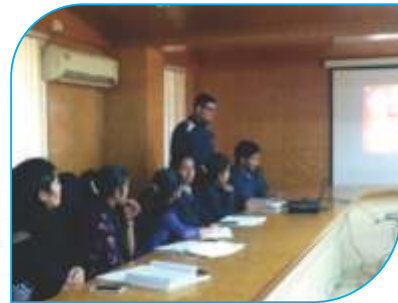
Live Budget Session