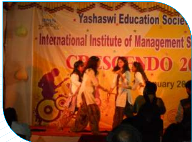
Performance of IIMS Student at Crescendo