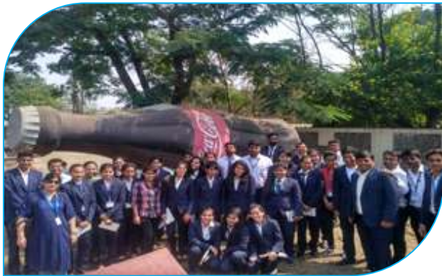
Hindustan Coca Cola Beverages P Ltd

At IIMS we organize Two Visits in each semester which helps The programme also helps keep students abreast with the current management practices followed by such organizations and acquire traits that the industry demands of them.