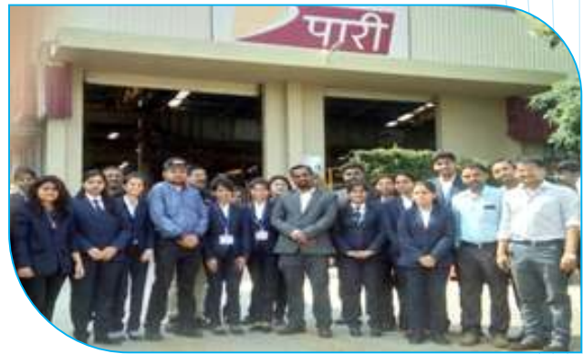
PARI Robotics P Ltd