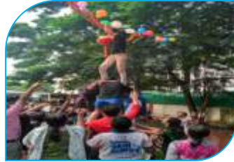
Dahi Handi Celebrations