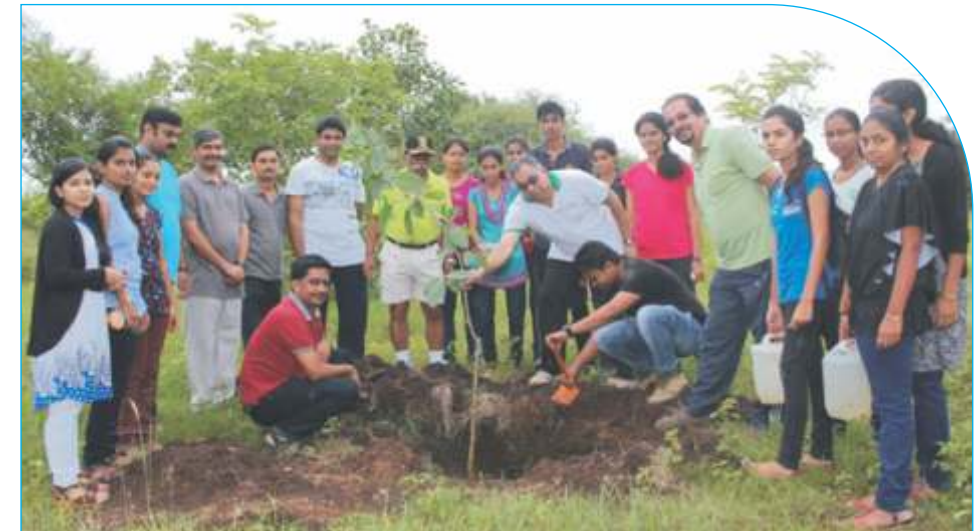
Students of IIMS at tree plantations on 'Chaturshringi Tekadi' Pune