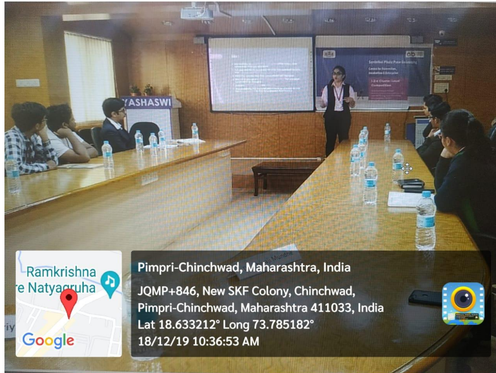
Photograph-1: Student presenting her idea: