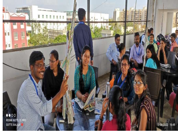
Business Plan Activity by students