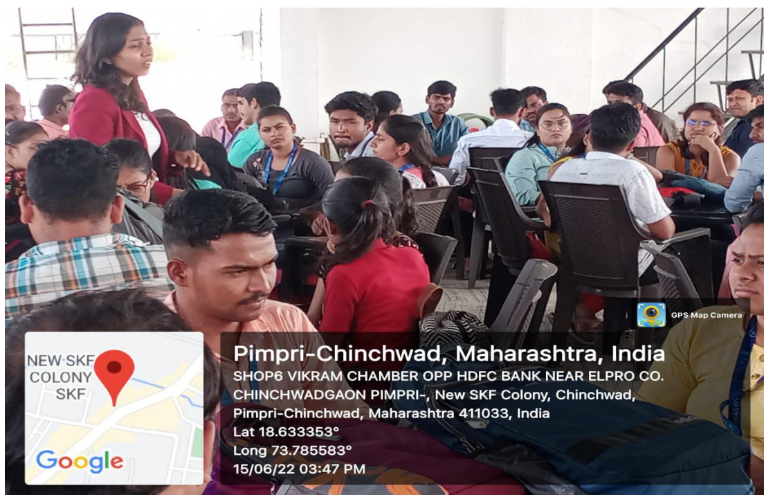
Student Participation in Soft Skill Activities