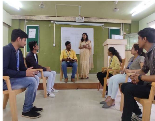
Soft skill Training activities performed by students