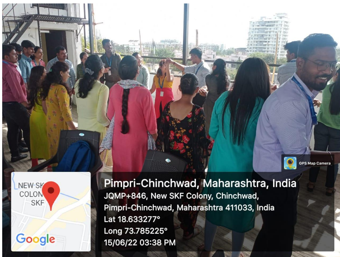
Student Performing the Activities