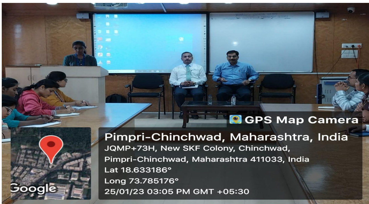
Students sharing their Feedback on the Session