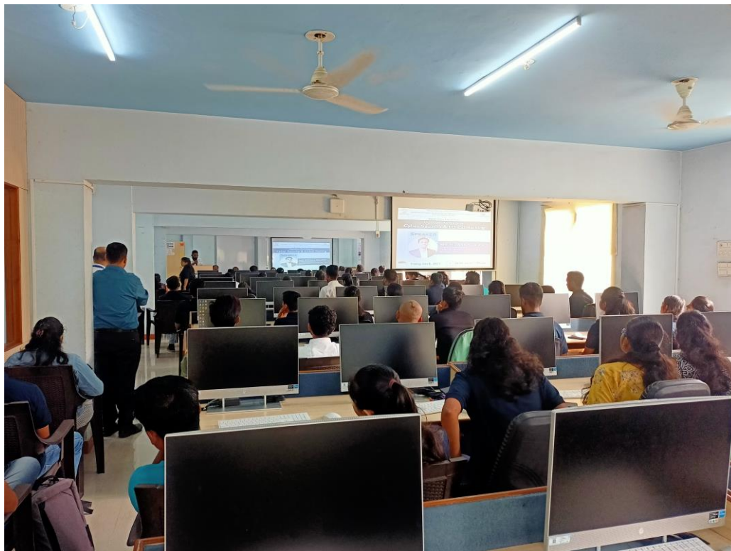
Students Participation in Hands-on Training