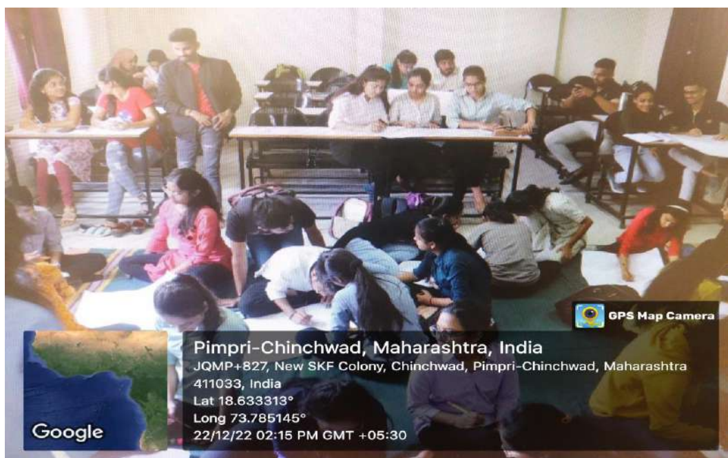
Student preparing for - Business Plan