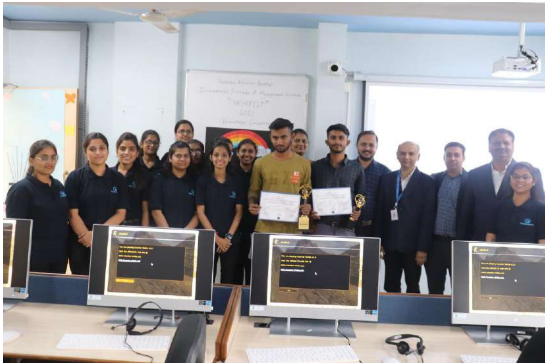
Winners & Participants of Counter Strike