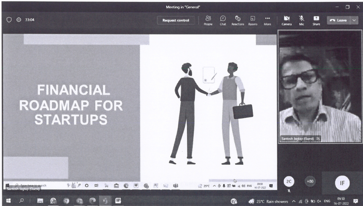
Screen shot from the Impact Lecture Series