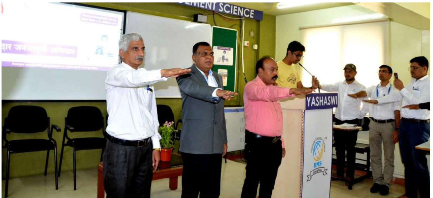
Students and Staff Members taking the pledge.