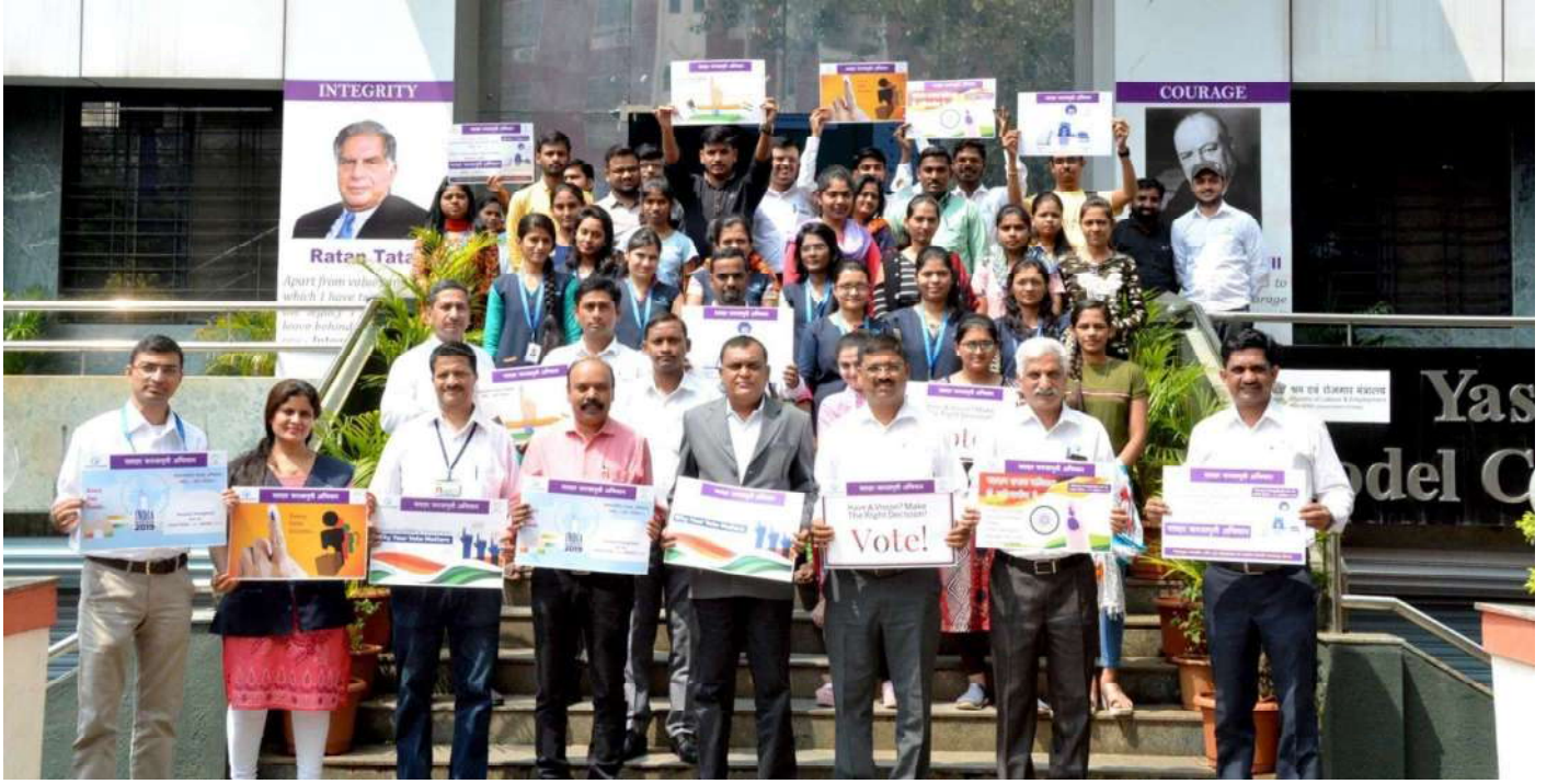
Students and Staff Members along with the Government Officials in Matdar Jan Jagruti Abhiyan-2019