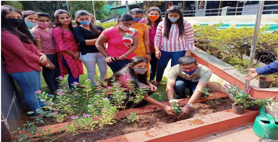
Students of IIMS during Tree Plantation