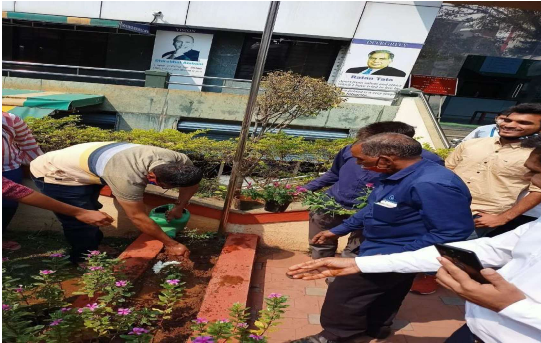
Students of IIMS during Tree Plantation