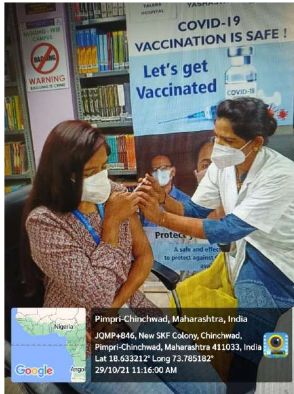
IIMS staff taking vaccine