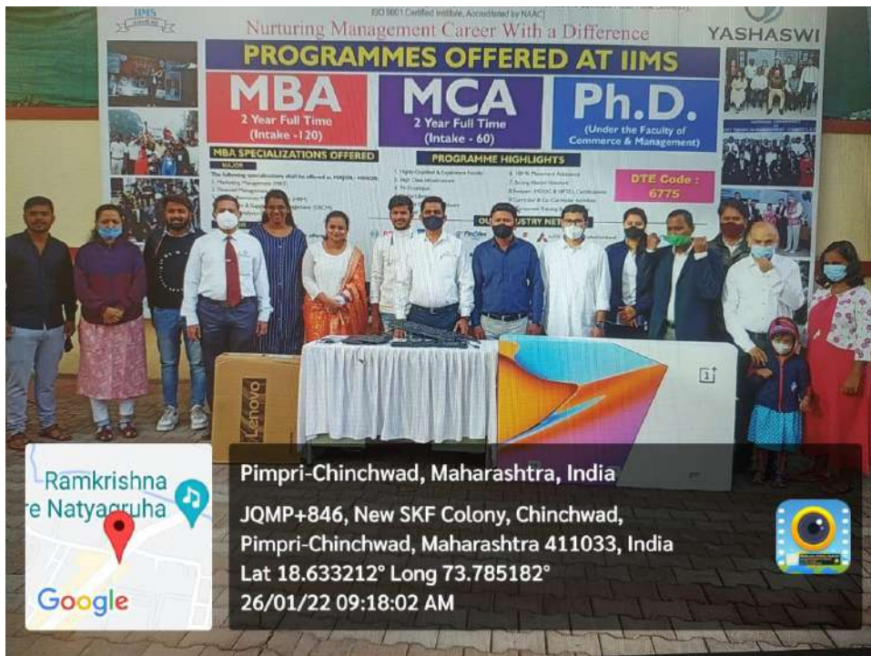
E Waste Drive on 26th Jan 2022