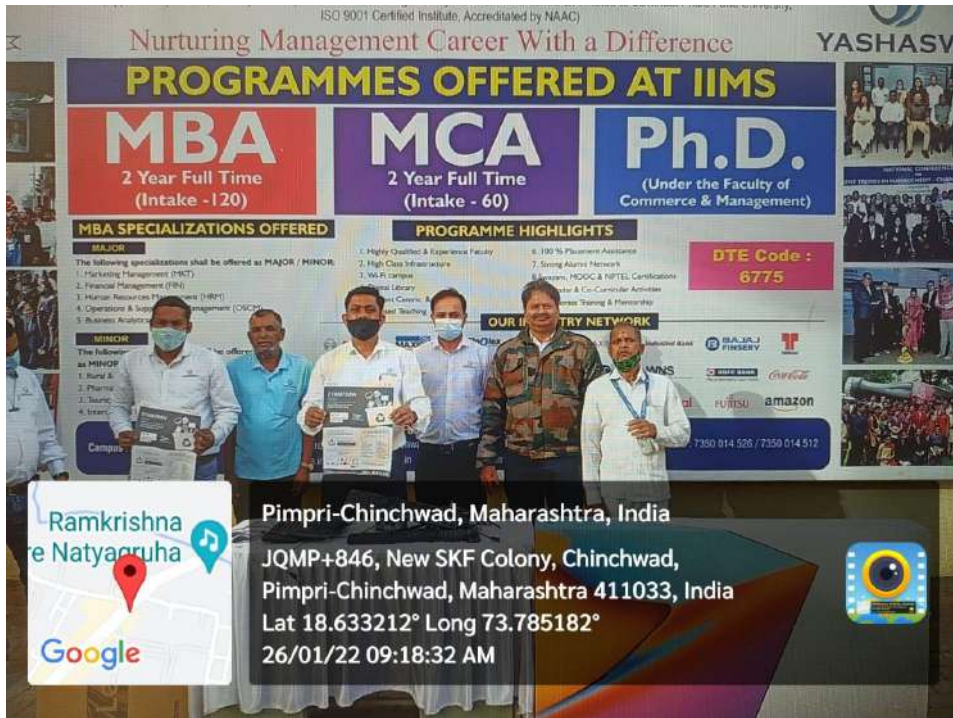
E Waste Drive on 26th Jan 2022