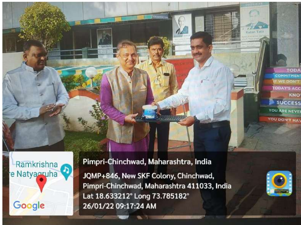
E Waste Drive on 26th Jan 2022