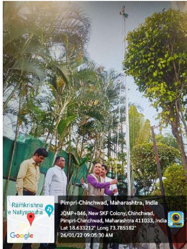
Flag Hoisting by Chief Guest