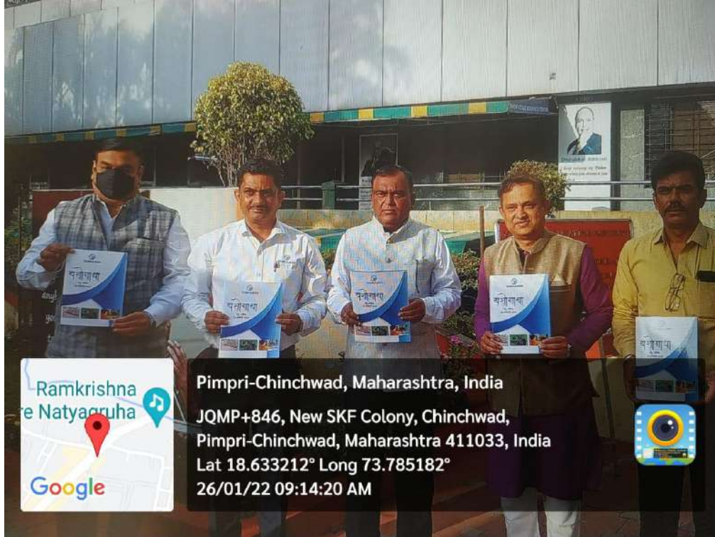
Launching of Yashogatha