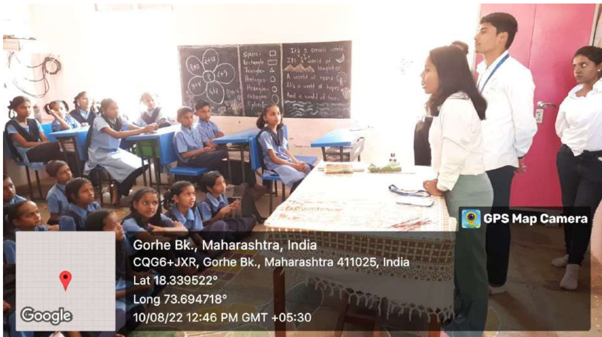
Session on Good touch and Bad touch