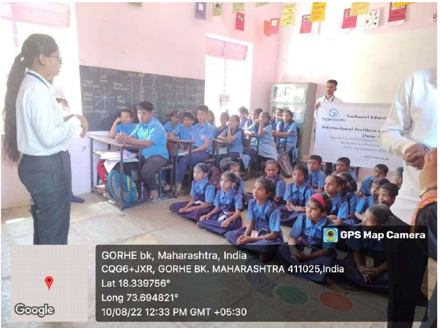
Session on Life skill Education