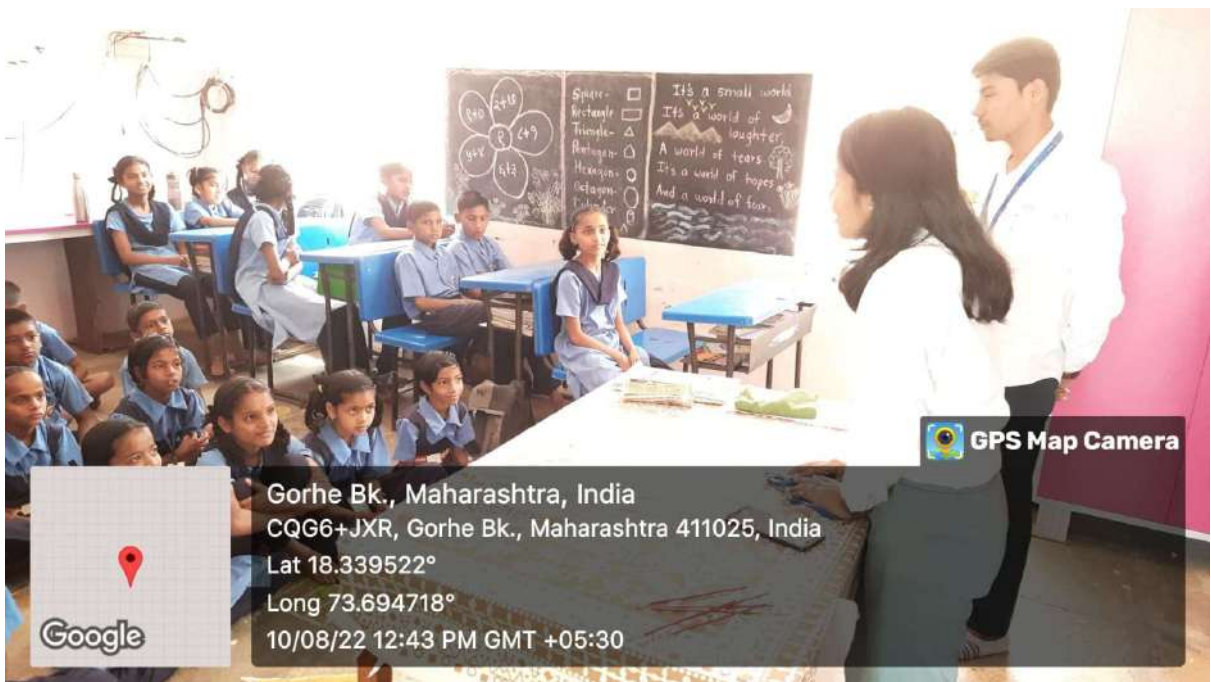
Session on Life skill Education