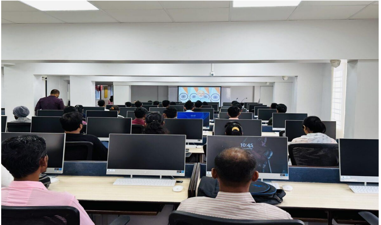
Students attending the webcast of Hon. Prime Minister Shri Narendra Modi: