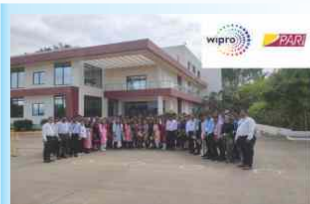
Industrial Visit : Wipro-PARI