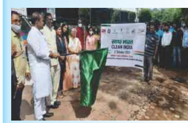
Swachha Bharat Abhiyan