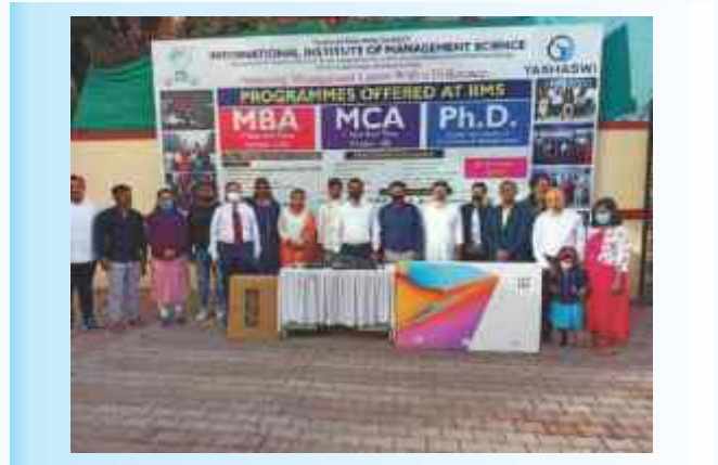
E - Waste Donation Drive