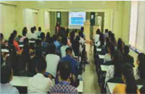
Barclay's Life Skills Training Programme