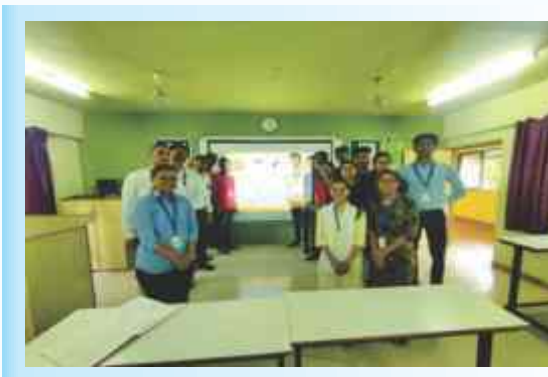
Smart India Hackathon