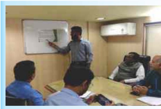
Avishkar Research Competition