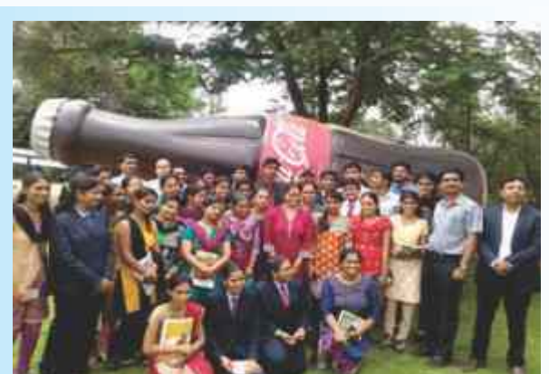
Industrial Visit : Coca-Cola