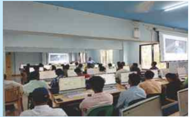
Power BI Workshop