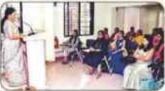
आयआयएमएसच्या आणि आर्थिक, वित्तीय, एचआरआय आणि विकासाच्या कार्यशाळात सहभागी असलेले सहभागी. (आयआयएमएस) च्या कार्यशाळात सहभागी असलेले सहभागी.