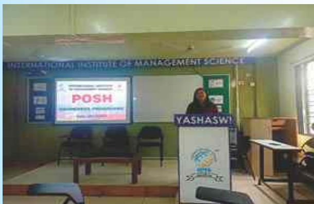
POSH Awareness Programme