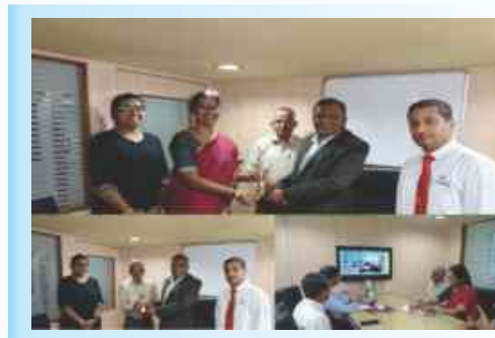
IIC- Mentor Institute Interactions