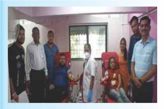
Blood Donation Drive