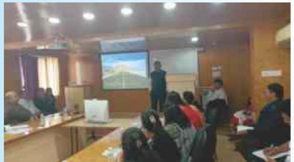
Research Methodology Workshop